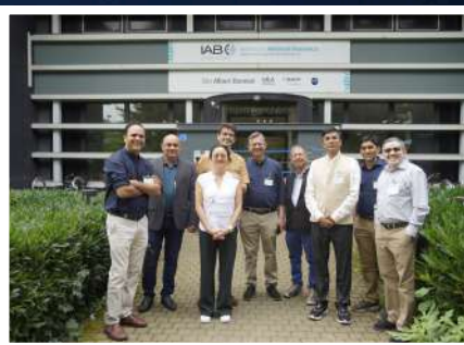
Indo-French Workshop on “Genomics and Omics Strategies to target Drug Resistant Malaria” at Institute Jean Roget, Grenoble, France (1-2 July, 2024 )