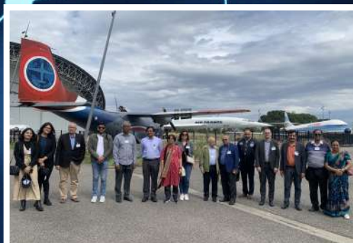
Airbus 350 tour - 12 June, 2024