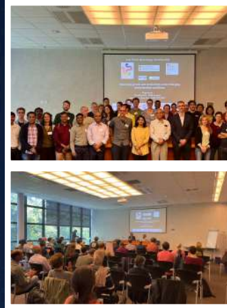
Indo-French Workshop on “Two Dimensional Ferrioc Materials and Devices” at Strasbourg, France (27-28 June, 2024 )