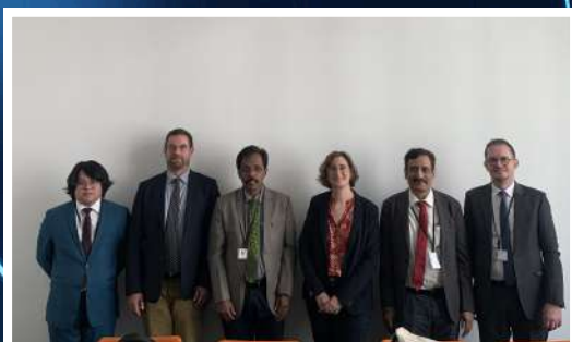
Meeting with MESR - 6th June, 2024.