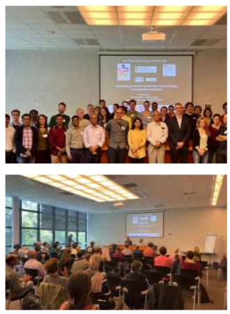
Indo-French Seminar on “Improving Crop growth & productivity under changing environmental conditions” at ENS, Lyon (30-31 May, 2024 )