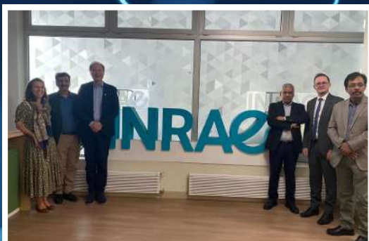
Meeting with INRAE - 7th June, 2024