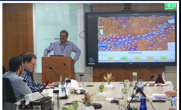
Indo-French Seminar on State-of-the-Art Techniques in River Corridor Research and Management: An Indo-French Perspective” at IIT Delhi (4-5 July, 2024 )